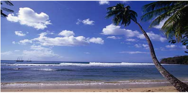
Secluded little beach, with anchored yachts nearby, Trinidad