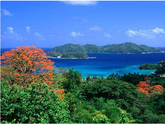
View from northeast coast of Tobago, looking towards Little Tobago Island