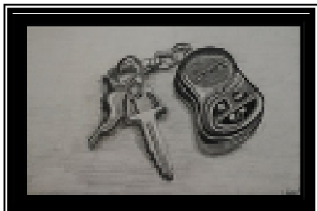
KEYS drawing—honorary mention