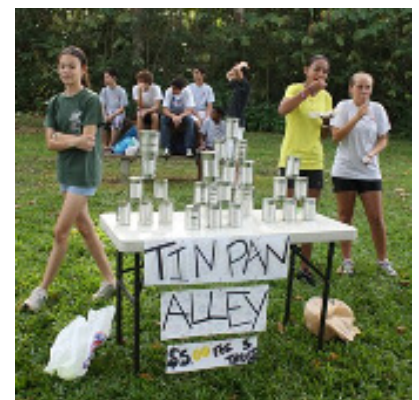
Take a try at Tin Pan Alley.