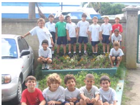
Gr. 3 planted and maintained a flower garden at the Main Campus