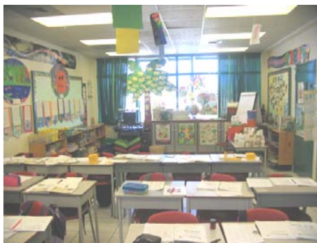
Gr. 3 went bananas over books, reading 150 collected in 2 months and celebrated with a banana split party!